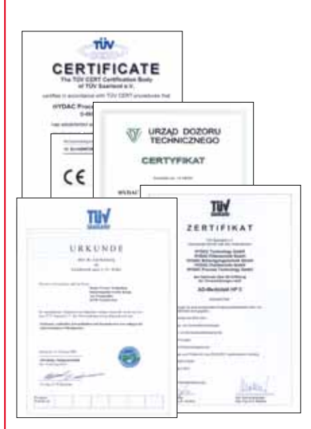
In addition to a number of international approvals and authorisations, HYDAC Quality Management is certified according to DIN EN ISO 9001, guaranteeing a consistently high quality of our products.